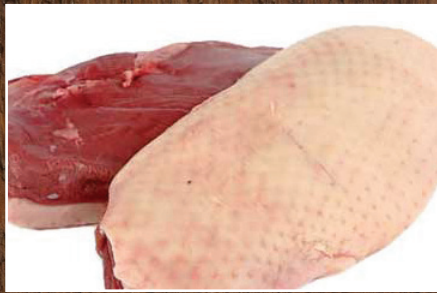
Duck Breasts approx. 200g £3.49 each