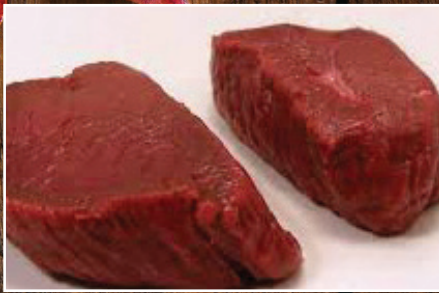
Venison Steaks approx. 168g £3.95 each