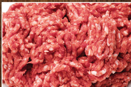
Minced Lamb £6.98 per Kg