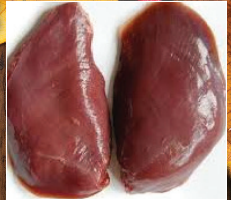
Pigeon Breast Approx. 60g £1.49 each