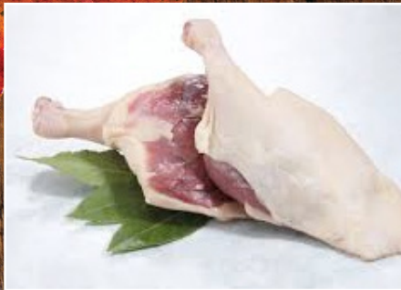
Duck Legs £1.49 each

ROE AND RED DEER AVAILABLE NOW PLEASE CALL FOR MORE DETAILS