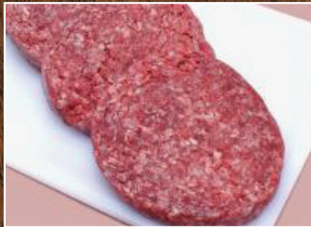
Venison Burgers approx. 170g £1.99 each