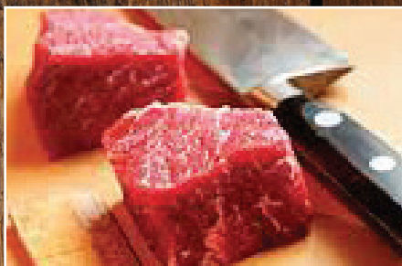
Beef Daubes approx. 200g £2.95 each