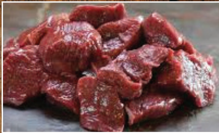
Diced Venison £10.98 Kg