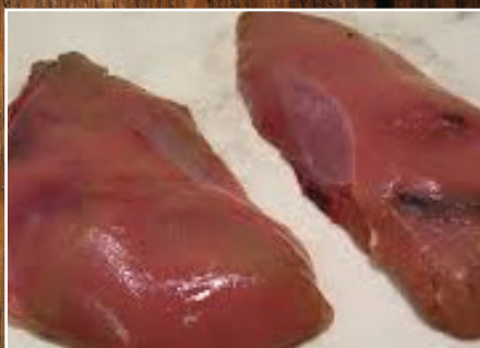
Pheasant Breasts Approx. 90g £1.50 each