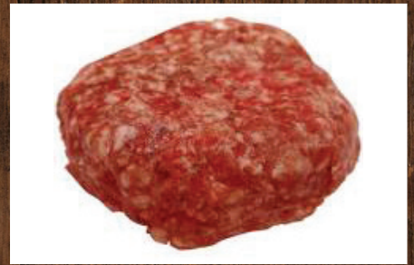
Highland Wagyu Beef Burger £3.95 each