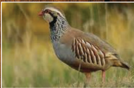
Partridge (Head and Legs on or Oven Ready Available) POA