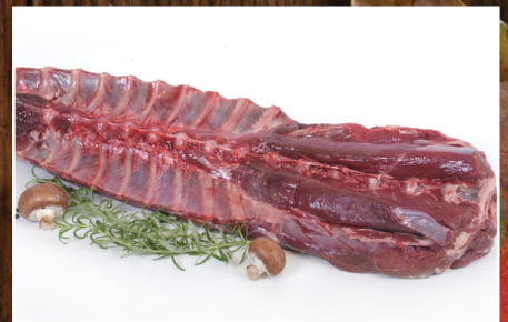
"Dry Aged" Venison Saddle POA