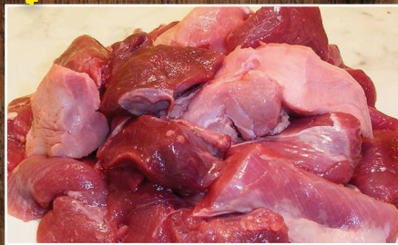
Diced Game Mix £9.98 Kg