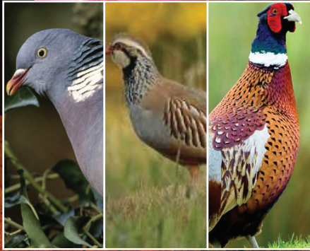
Trio of Game (pigeon, partridge and pheasant breasts) £3.99 each