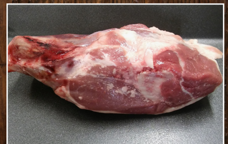
Mini Lamb Shanks £2.99 each