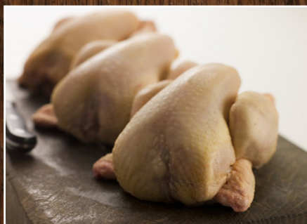
Poussin £2.99 each

Stock TRUEfoods ® based on culinary principles