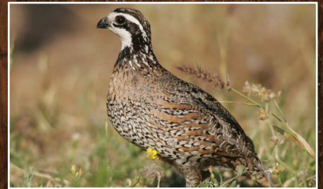
Royal Quail £2.99 each