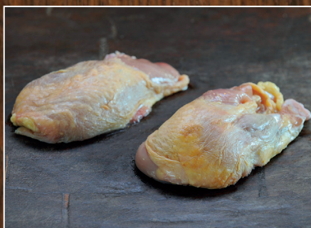
Guinea Fowl Breast