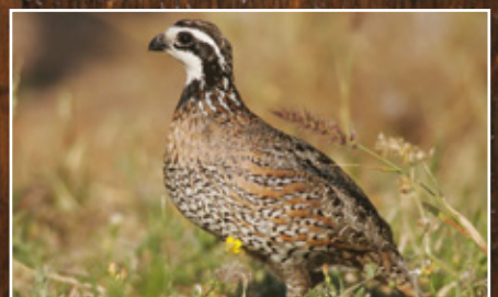
Large Royal Quail £3.48 each