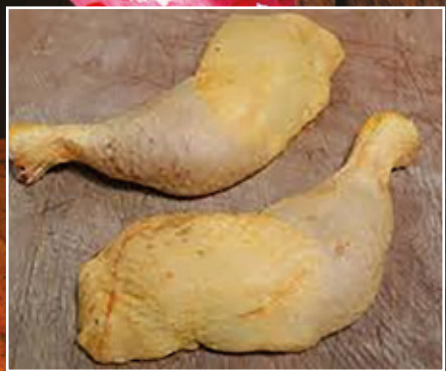
Cornfed Chicken Legs 99p each