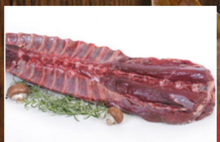
"Dry Aged" Venison Saddle POA