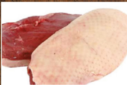
Duck Breasts approx. 200g £4.98 each