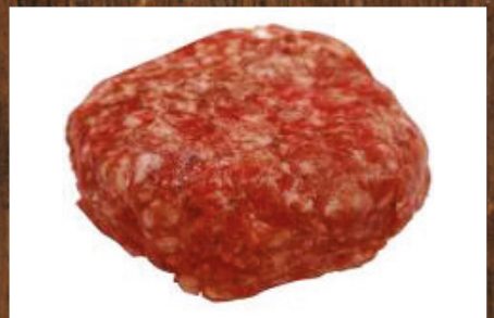
Highland Wagyu Beef Burger £4.45 each