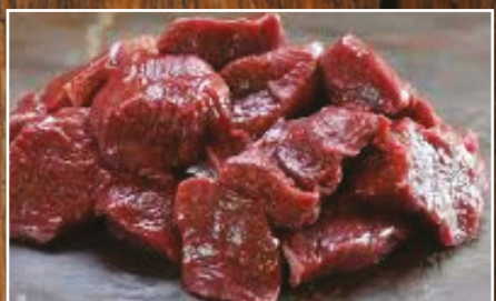
Diced Venison £10.98 Kg