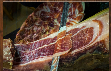
Iberico Pork Available - Please call for more details'