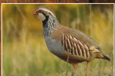
Partridge (Head and Legs on or Oven Ready Available) POA