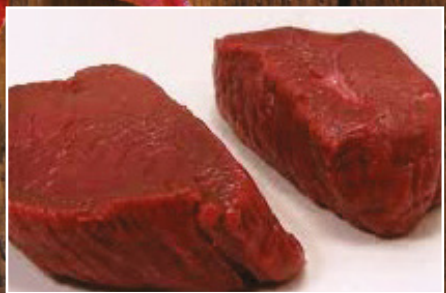
Venison Steaks approx. 168g £4.95 each