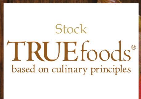
Call for more details