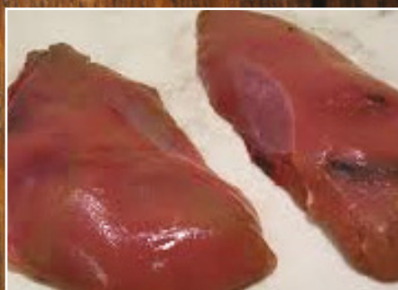
Pheasant Breasts Approx. 90g