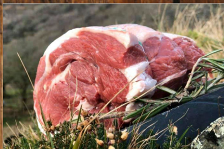
Herdwick Lamb available - Please call for more details