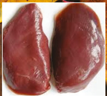
Pigeon Breast Approx. 60g £1.95 each