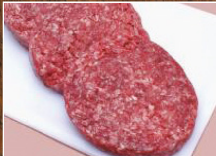
Venison Burgers approx. 170g